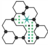
Biotechnology and Bioscience Applications