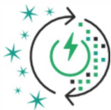
Clean Energy Transition