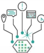
Advanced Materials and Manufacturing